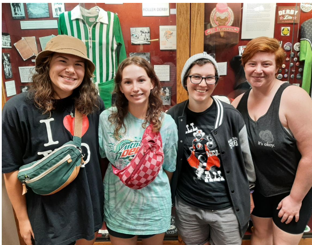
These four women pictured in front of the Museum's derby display, were skating competitors, but not for USA Roller Sports Nationals. They are members of the Twister City derby team from Oklahoma City who were in town to compete against Lincoln's derby team.