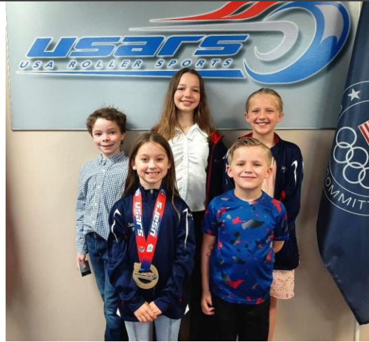
Picking out a medal for a photo on the podium is one of the most popular activities for competitors who visit the Museum. Pictured here are members of the Kirby, Palis, Blutt and Pheffer families.