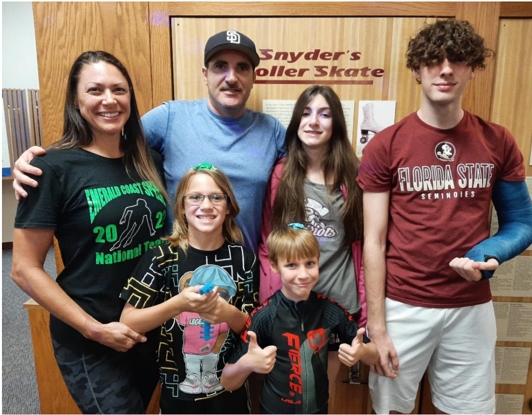
The Scott family is an example of the many entire families who come together to the Museum.